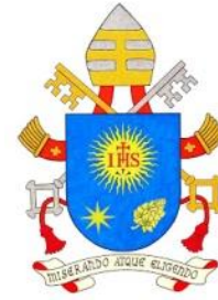
Pope Francis Vatican City State