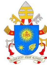
Pope Francis Vatican City State

EPIPHANY OF THE LORD Saturday Vigil at 6:00 p.m. For the People Sunday at 10:00 a.m. All First Responders