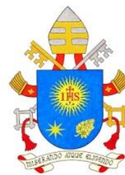
Pope Francis Vatican City State

Saturday 4:30-5:30 p.m. Wednesday 6:00-6:30 p.m. First Friday 4:00-5:30 p.m.