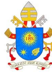
Pope Francis Vatican City State