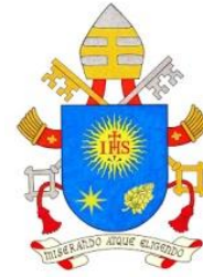
Pope Francis Vatican City State