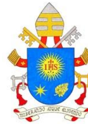
Pope Francis Vatican City State

Sacrament of Reconciliation Saturday 4:30-5:30 p.m. Wednesday 6:00-6:30 p.m. First Friday 4:00-5:30 p.m.